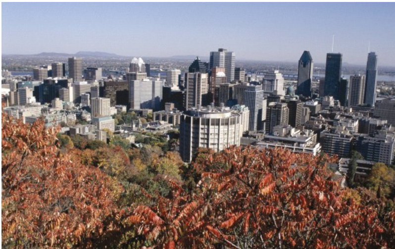
View of Montreal from Mount Royal Park