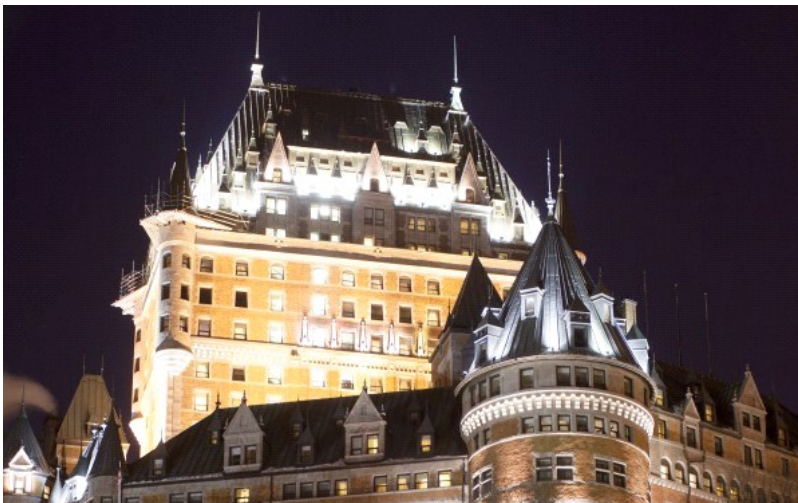
Quebec City