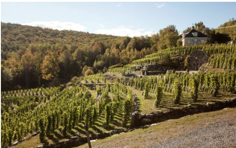
Chapelle Ste.Agnès Vineyard Eastern Townships