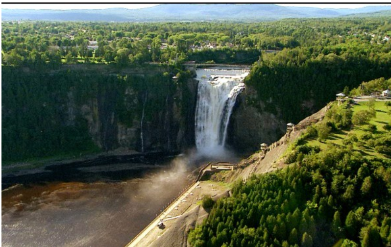
Montmorency Falls

Say Canada as a holiday destination and most people immediately think of snow and skiing. They would be right, but there is another entirely different face to Canada – warm sunny days, a long history, fine wines and a gourmet's paradise.